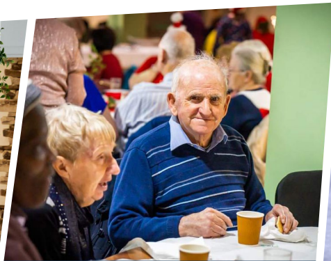
BELONGING AND INTEGRATION

To our donors and supporters, thank you. Your commitment makes the Community Impact Fund possible, strengthens communities, and helps improve lives across Britain and Northern Ireland, including many in the Irish diaspora. Read on to discover the inspiring impact your generosity is helping to achieve in 2026.