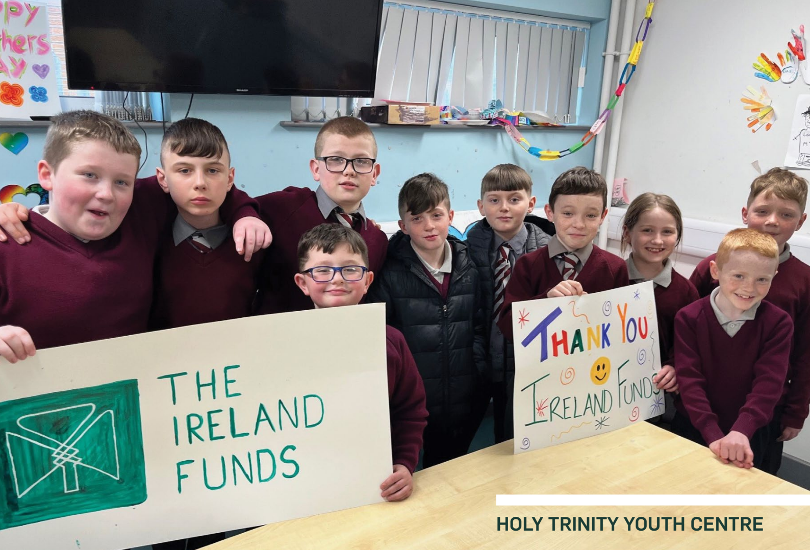
HOLY TRINITY YOUTH CENTRE