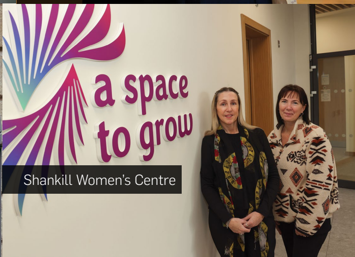
Shankill Women's Centre