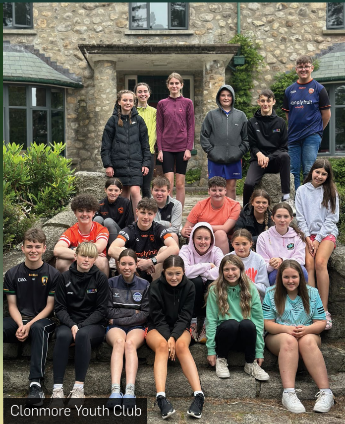
Clonmore Youth Club

strengthened impactful initiatives that engaged people with skill-building, expanded employment opportunities, mental health support, and arts and cultural programming. It also supported work targeting disengaged youth and organisations in rural and hard-to-reach areas.