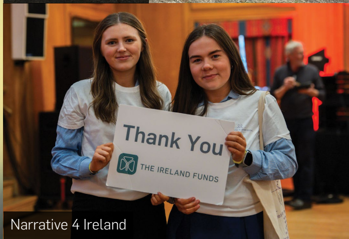
Narrative 4 Ireland