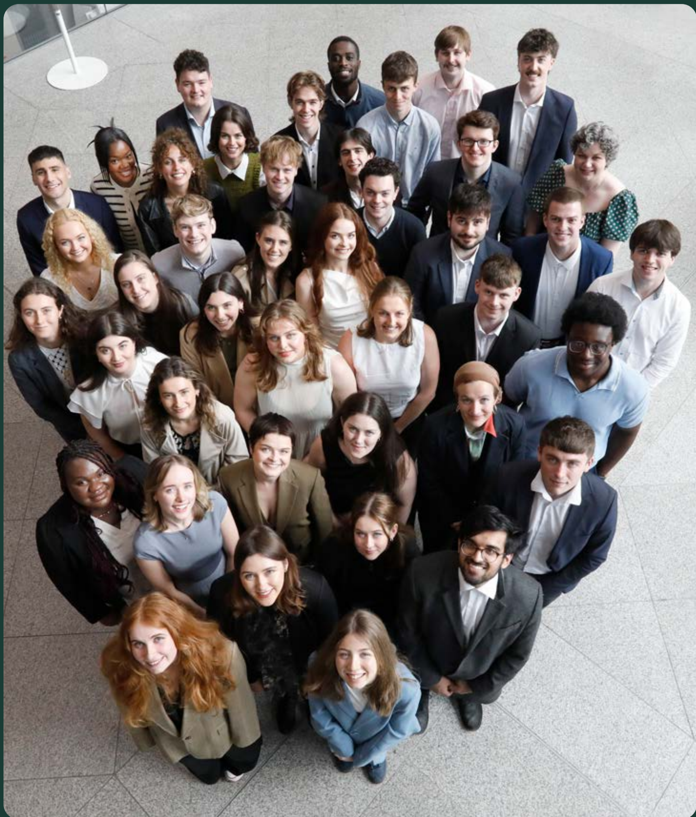
The George Moore Scholars