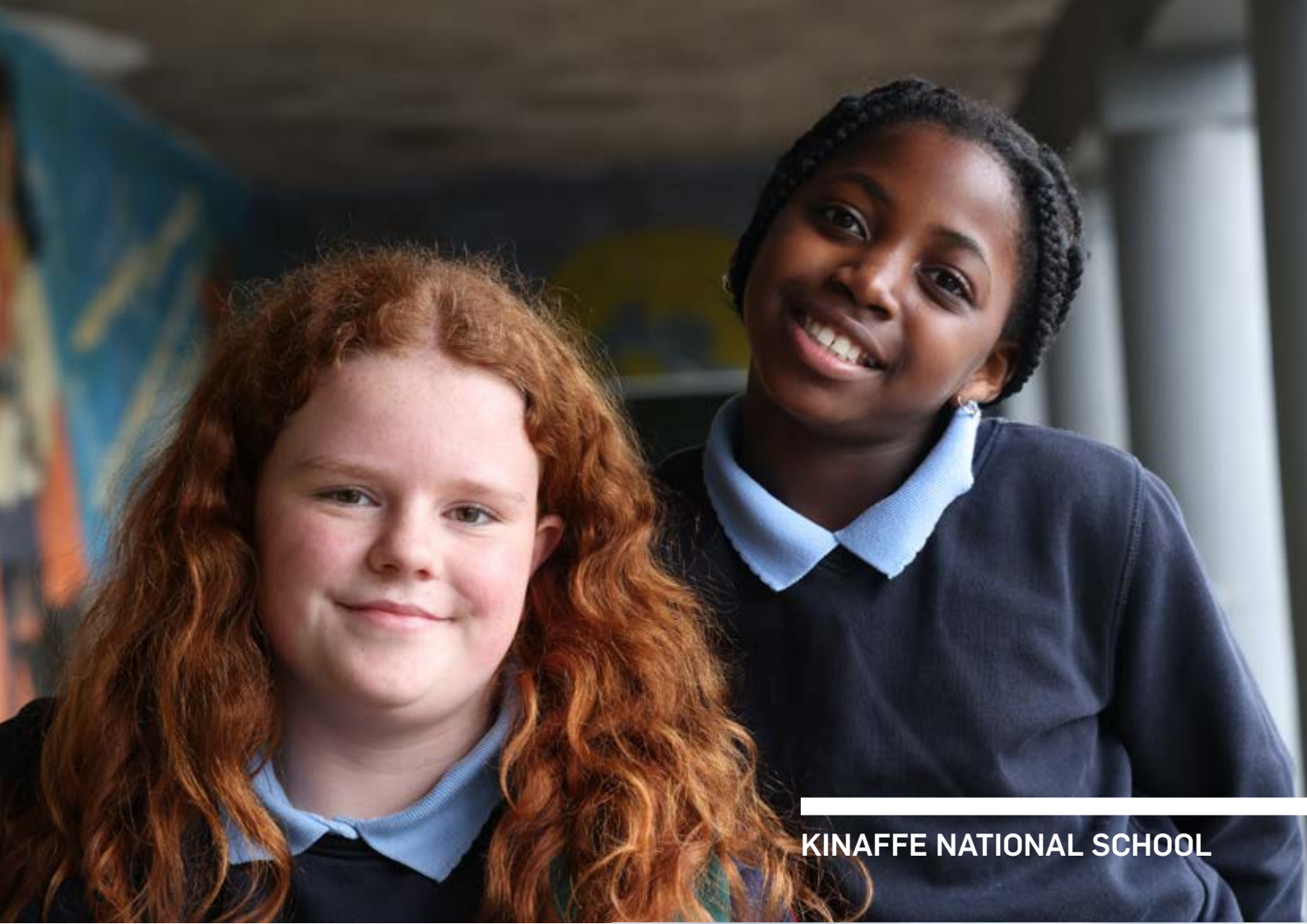
KINAFFE NATIONAL SCHOOL