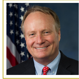
THE HONORABLE DAVID P. JOYCE