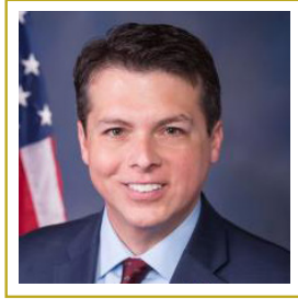
THE HONORABLE BRENDAN F. BOYLE