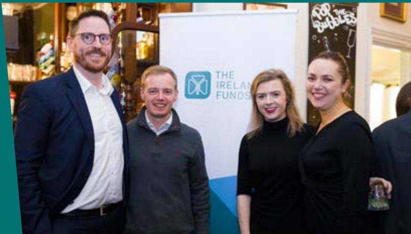
Young Leaders Society