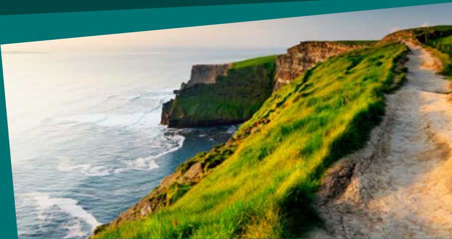
100 Club Members