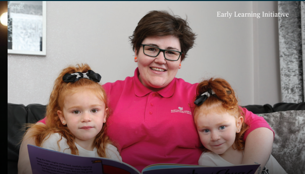
Early Learning Initiative