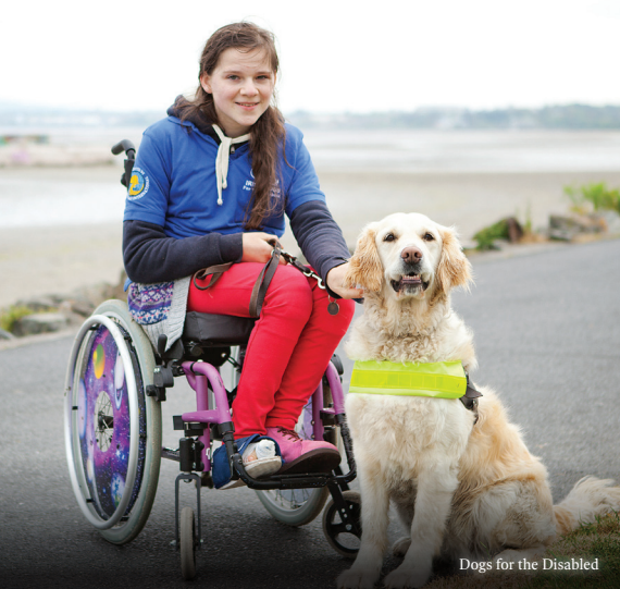
Dogs for the Disabled