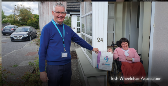
Irish Wheelchair Association