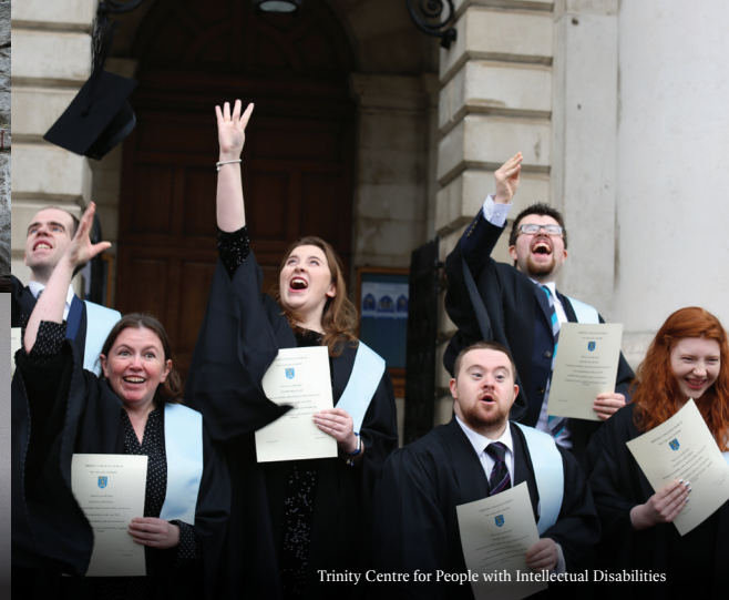
Trinity Centre for People with Intellectual Disabilities