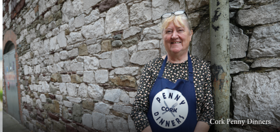
Cork Penny Dinners