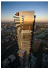
Value in excess of $4,800

The dining room is perfect for a memorable night out and the versatile event spaces play host to everything from sunrise breakfasts, glamorous cocktail parties, sit down dinners and evening soirees. Enjoy an indulgent five course degustation menu for 30 guests in a private room at Eureka 89. Fine wines will be matched with each course to enhance the dining experience. Bookings for this 3 hour food and wine experience are available Tuesday to Thursday evenings, or Sunday lunchtimes, based on availability (excluding November and December). This exciting opportunity is available for redemption prior to 30 th June 2019.