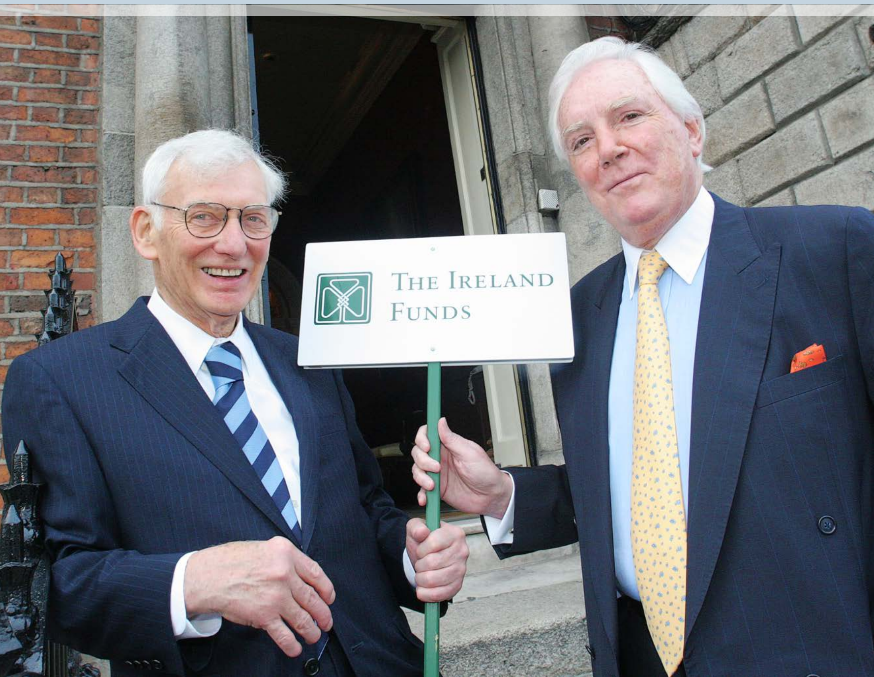
Co-founders of The Ireland Funds, Dan Rooney and Tony O'Reilly