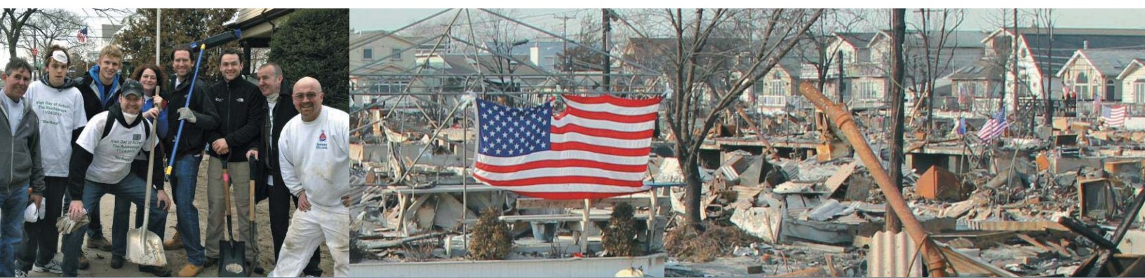
Volunteers including many Ireland Fund Young Leaders came to the two Irish Days of Action to help clean up and begin to rebuild.

"There is no doubt but that a crisis brings out the best in the Irish. We saw that with the reaction of the Irish among the first responders during the 9/11 attacks. We saw it again over the past two months as the Irish and Irish American communities responded immediately to the tragedy of Hurricane Sandy. That response took many forms ranging from immediate assistance with clothes and food in the first days to more long-term financial support to the worst affected communities—and not just in the traditional Irish neighborhoods of Breezy Point and Belle Harbor. Two Irish Days of Action in the Rockaways brought together all the Irish and Irish American organizations in a common effort to bring assistance to the worst affected areas.