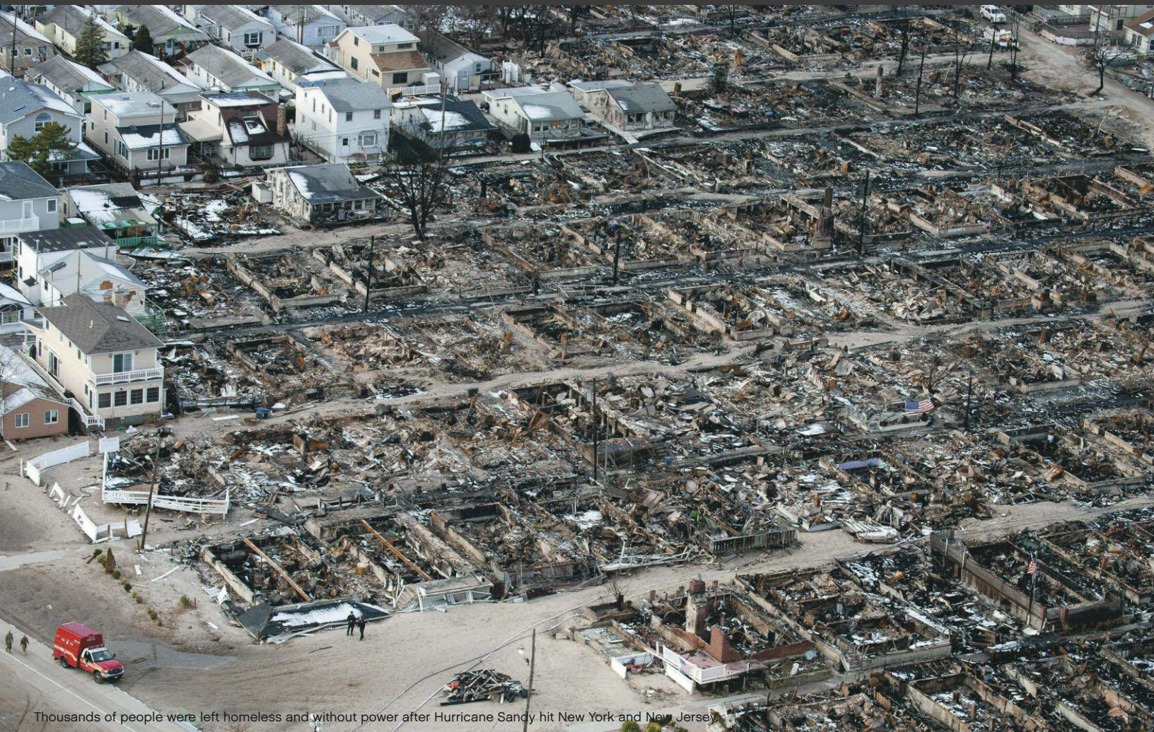
Thousands of people were left homeless and without power after Hurricane Sandy hit New York and New Jersey.