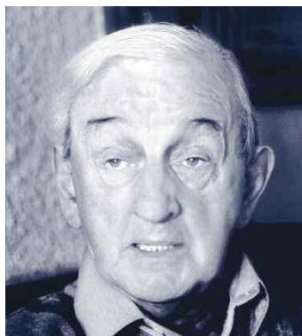
John B. Keane, Literary Award recipient 1988.