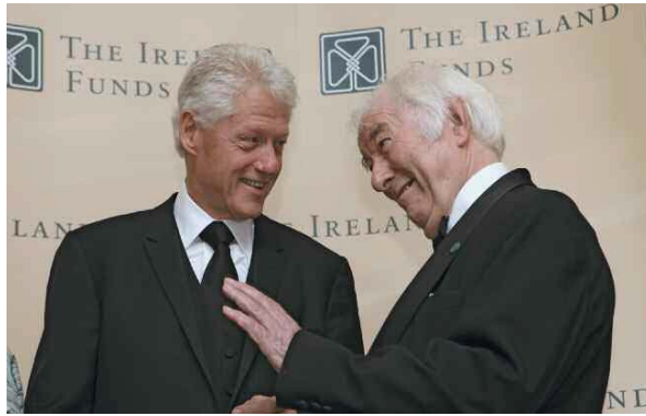
Former US President Bill Clinton with 2012 Lifetime Achievement Awardee Seamus Heaney