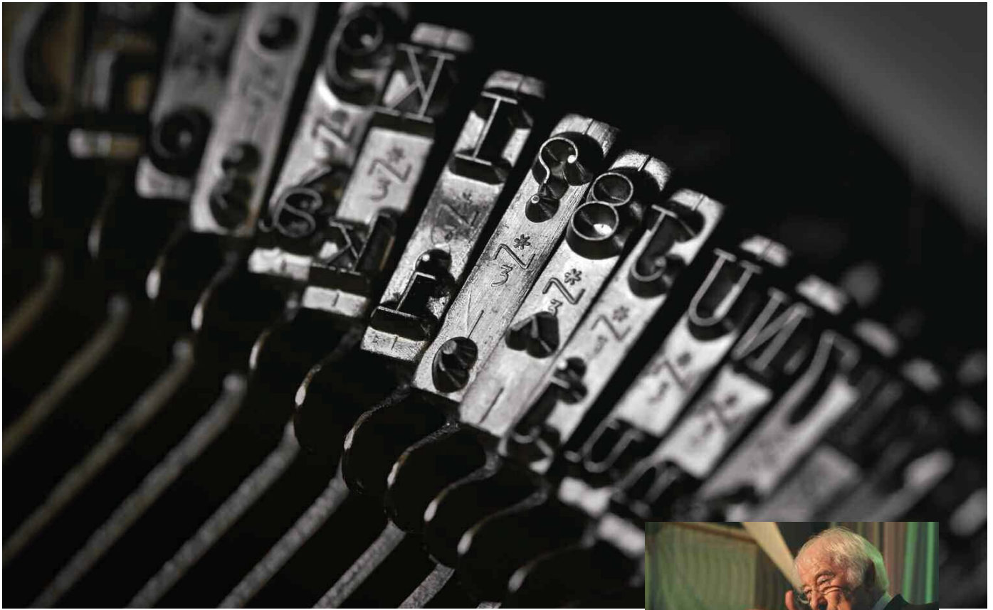
Nobel Laureate Seamus Heaney accepting the Lifetime Achievement Award on the 40th Anniversary celebration of The AWB Vincent American Ireland Fund Literary Award