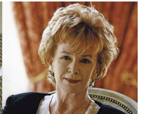
Edna O'Brien, Literary Award recipient 2000.