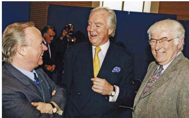
Brendan Kennelly, Literary Award recipient 1999 with Sir Anthony O'Reilly and Seamus Heaney.