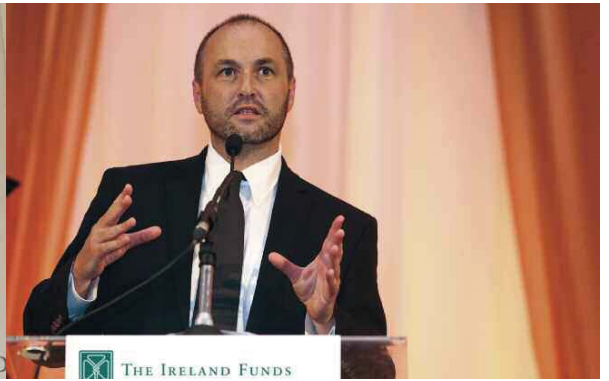
The 39th Literary Award, 2011, Colum McCann.