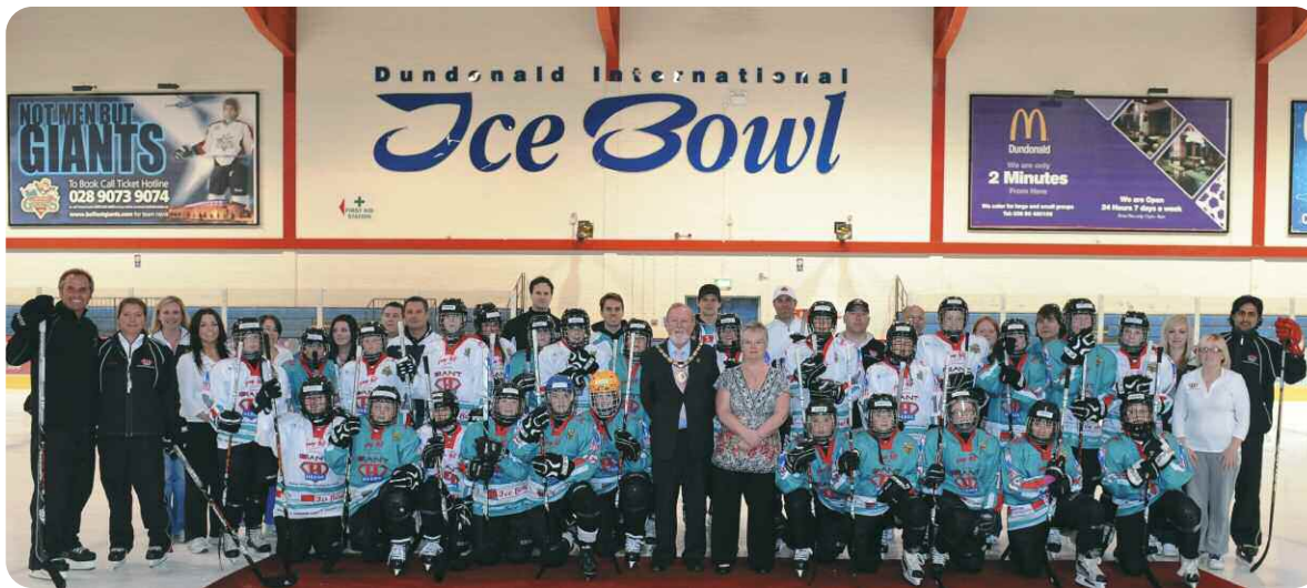
The Giant H.E.R.O.S. kids from diverse communities in Ireland and Northern Ireland gather on the ice.