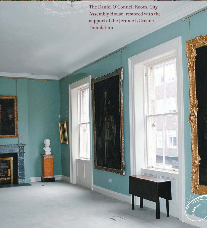
The Daniel O'Connell Room, City Assembly House, restored with the support of the Jerome L Greene Foundation

FOR THOSE THAT HAVE AN ENTHUSIASM FOR IRELAND'S CULTURAL HERITAGE, THE IRISH GEORGIAN SOCIETY OFFERS THE OPPORTUNITY TO CONSERVE AND CELEBRATE THESE UNIQUE ARCHITECTURAL FACETS OF IRELAND.