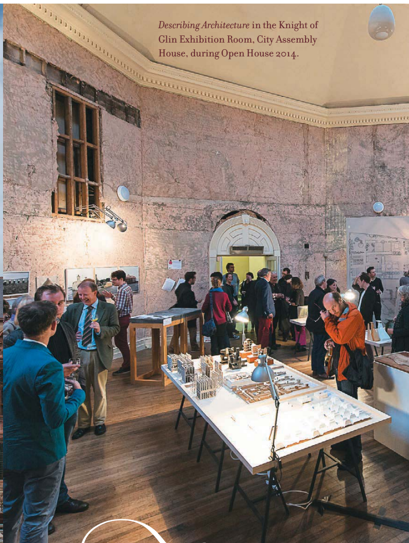
Describing Architecture in the Knight of Glin Exhibition Room, City Assembly House, during Open House 2014.