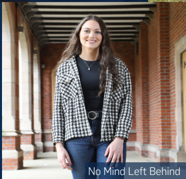
No Mind Left Behind