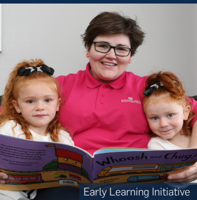
Early Learning Initiative

In 2021, The Ireland Funds America made over 544 grants totaling $17.7 million which supported the work of more than 300 organizations.