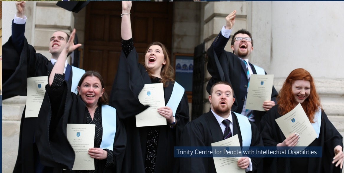
Trinity Centre for People with Intellectual Disabilities