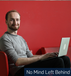
No Mind Left Behind