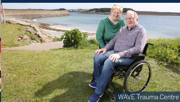
WAVE Trauma Centre